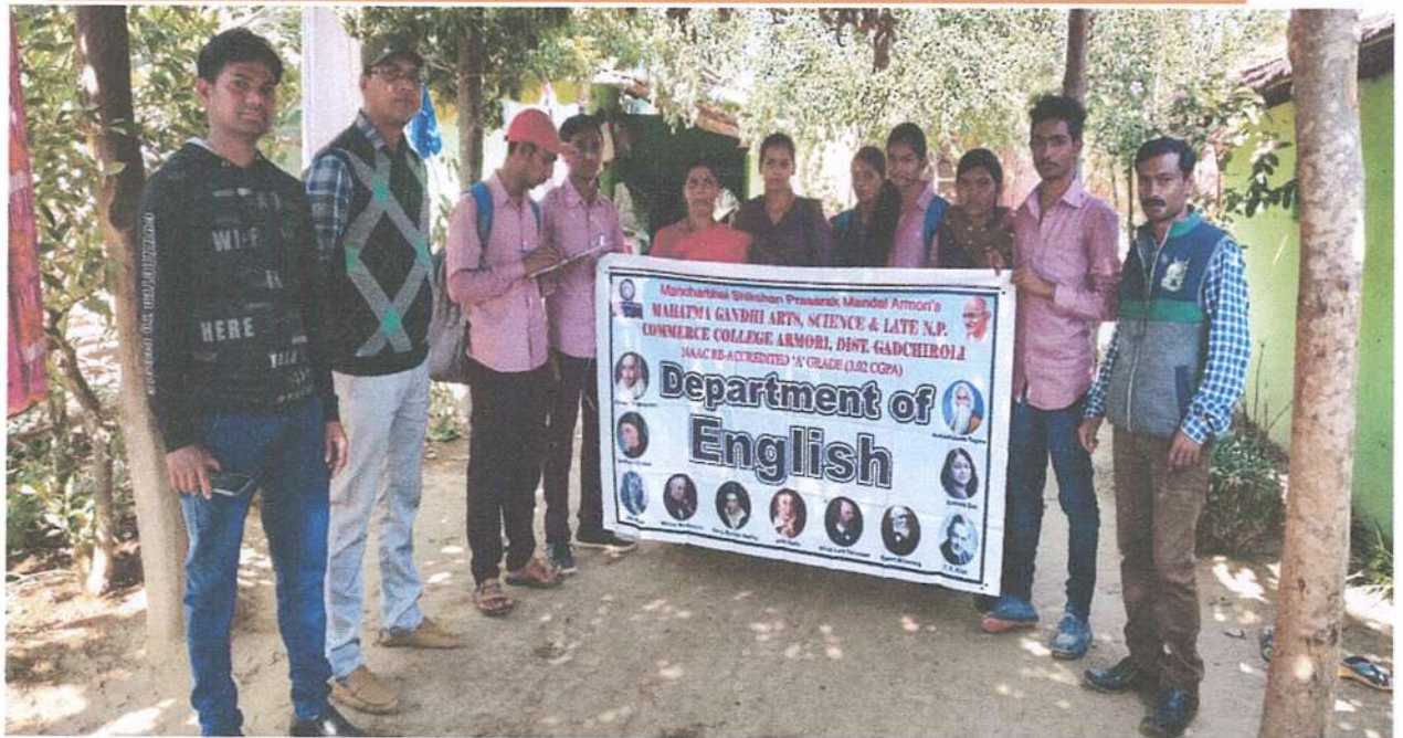
Students Conducted door to door Survey at Antarji